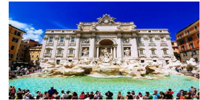
fontana di trevi