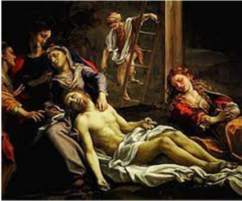
Lamentation over dead Christ